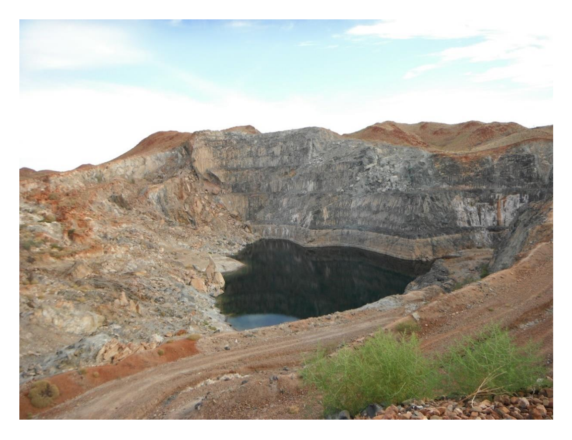
Plate 1: Iron Stirrup Deposit, Pilbara, WA

• Recent Placement raised $1.35M with a further $0.38k raised though an SPP for a total of $1.73M to underpin ongoing exploration activities at the Pilbara Gold Project.