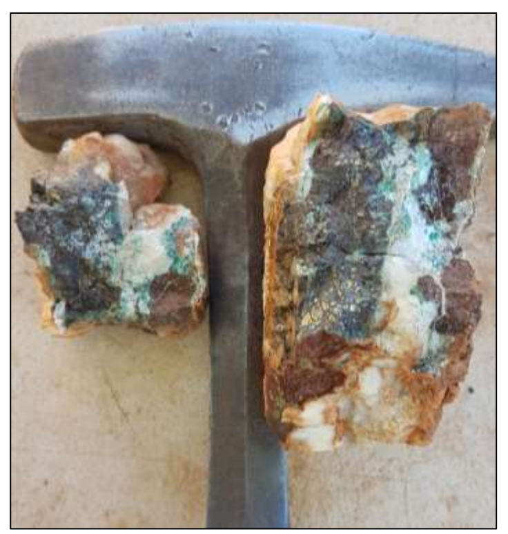
Figure 2: Rock chips samples of the high copper-gold vein in the older Archaean basement.

Kairos has conducted a detailed mapping and rock chip sampling program along with the in-fill soils sampling program to follow-up on the previous significant results of the older Archaean basement.