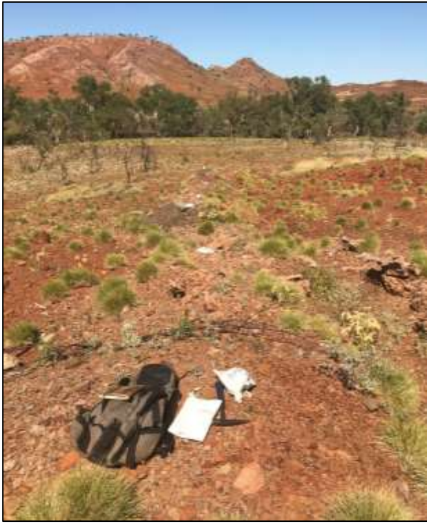
Figure 3: Historical trench and the high topographic older Archaean basement in the background where sample CYR170 was collected.