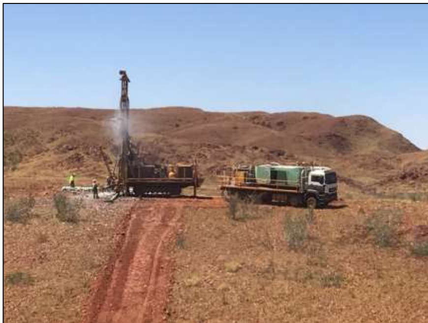
Figure 1: Track-mounted Reverse Circulation (RC) drill rig operating at the Fuego prospect, Croydon Project.