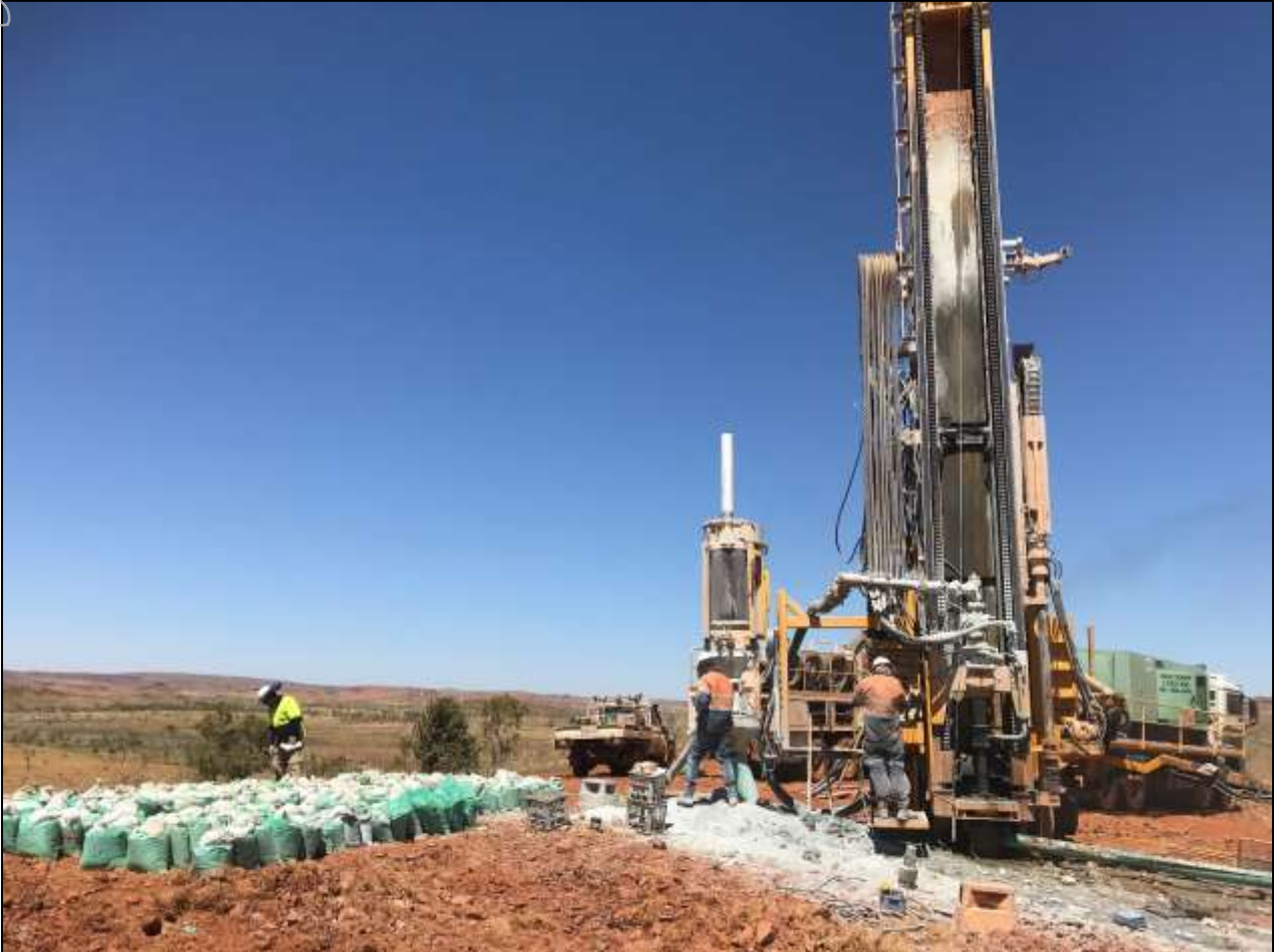
Figure 3: Mt Magnet Reverse Circulation (RC) drill rig operating at the Fuego prospect, Croydon Project.

Kairos' drilling contractor, Mt Magnet drilling company, has completed 20 RC holes for a total of 3,815m at Fuego prospect, Croydon Project. The rig has been mobilized to the Tierra prospect, with approximately 10 reconnaissance holes planned to be drilled in this first-pass program.