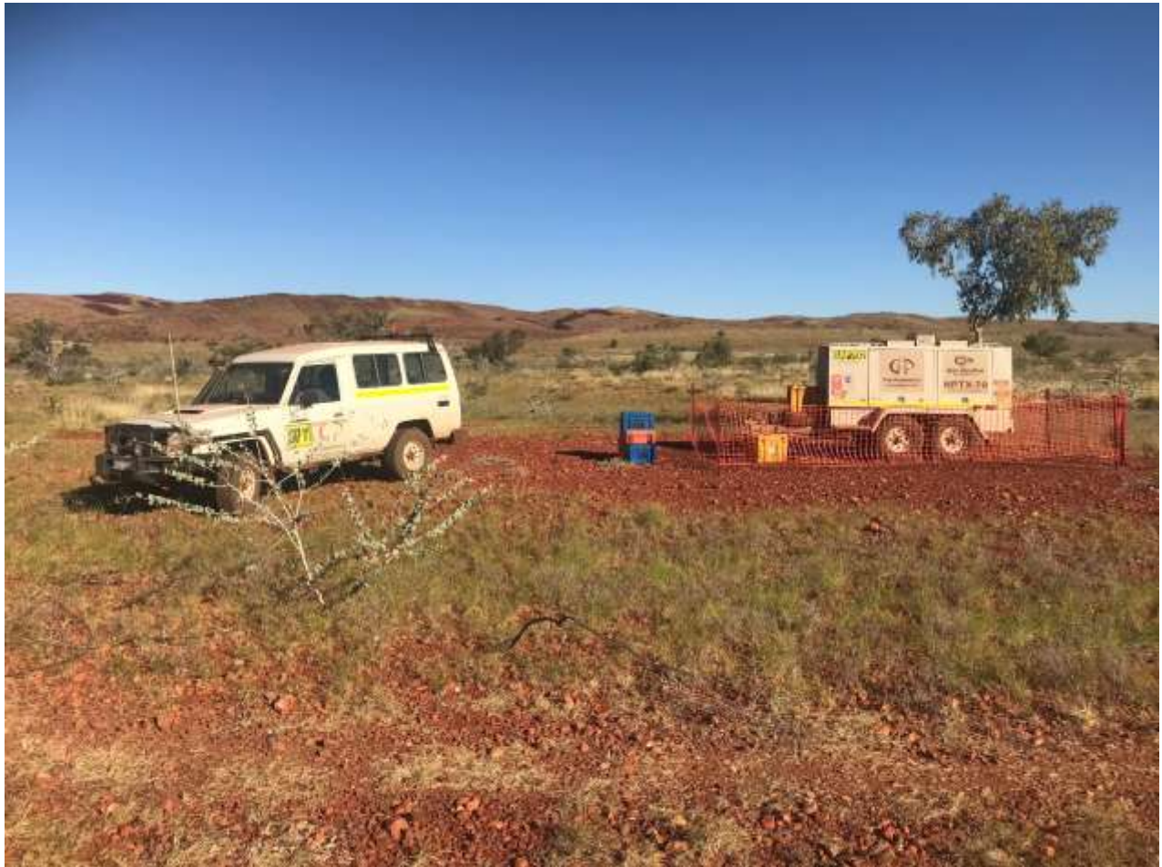
Figure 4: SAM Geophysical Survey in progress at the Fuego prospect, Croydon Project.

The survey is in progress over the Fuego prospect, with 168 line kilometres planned to cover over 5km strike of the geochemical anomaly. After completing the Fuego survey, the geophysical crew will move to the Tierra prospect to complete another 70 line kilometres of SAM survey. At the Mt York Project, two areas are planned to be covered by the SAM survey comprising a total of 21 line kilometres.