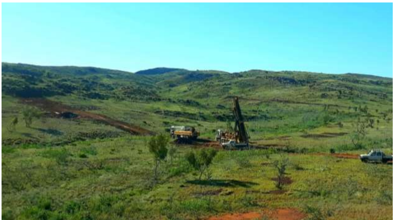
Figure 3: Reverse Circulation (RC) drill rig operating at the Fuego prospect, Croydon Project.

A rig is currently operating on site at Fuego, with a total of up to 12 widely spaced reconnaissance holes planned to be drilled in this first-pass program.