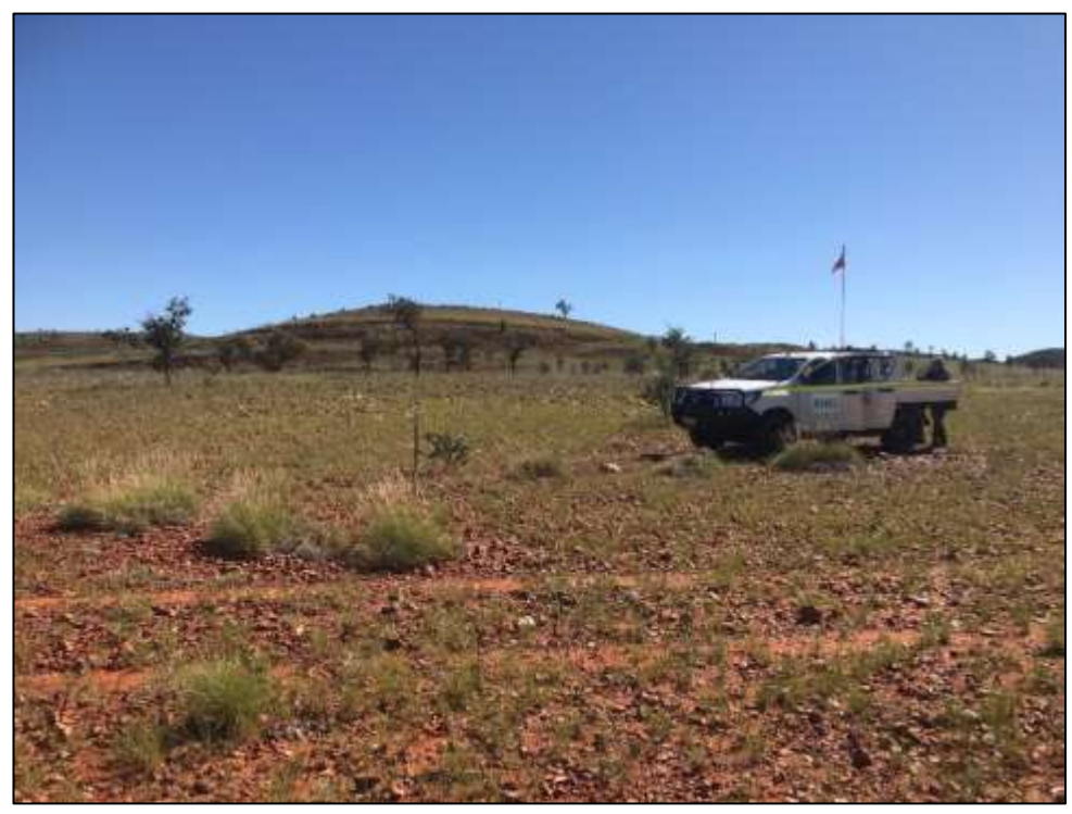
Figure 1: Recent photo from the Fuego Prospect (Croydon Project), peak soil anomaly (648ppb Au) on the top of the hill.